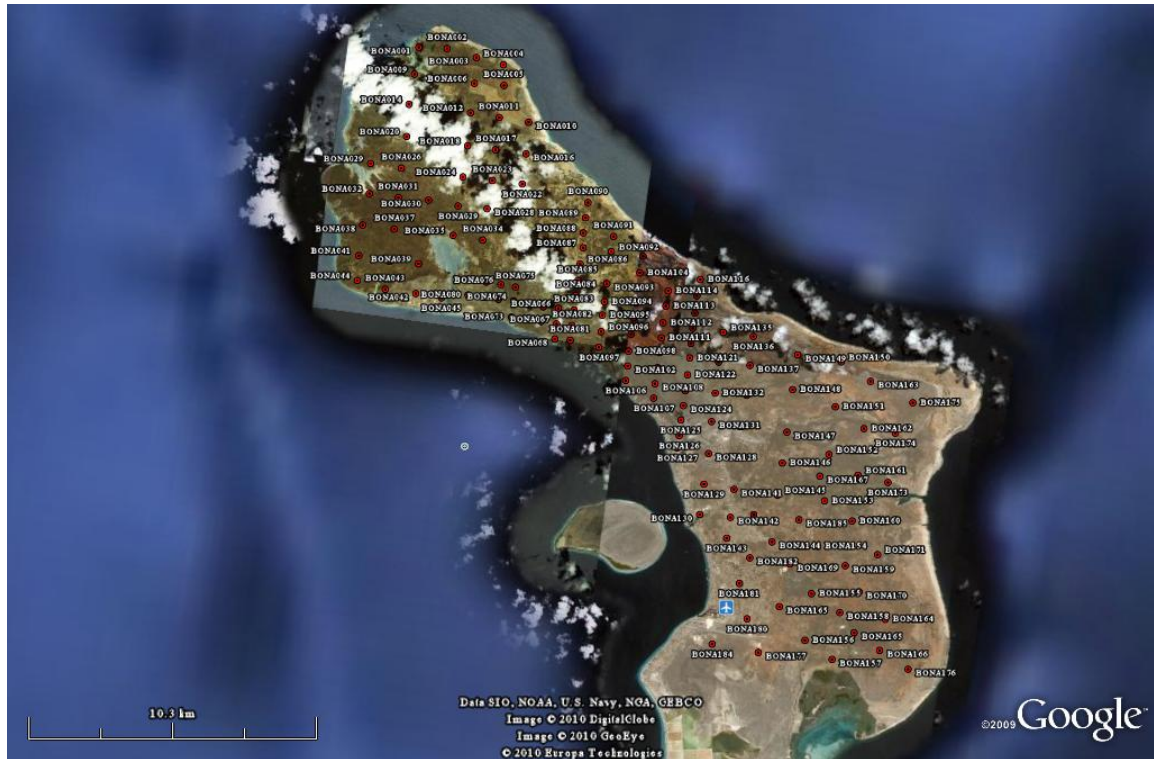
Figure 1. Map of Bonaire showing 185 points ( K ) from which a total of 110 points ( k ) were randomly chosen for sampling in December 2009 ( k = 62 ) and March 2010 ( k = 104 ). The survey region ( A ) covered 17,000 hectares, including the Washington-Slaagbaai National Park, Brasil, Karpata, Rincón, Tolo, Colombia, Washikemba, Bakina, Lima, and Belnem.